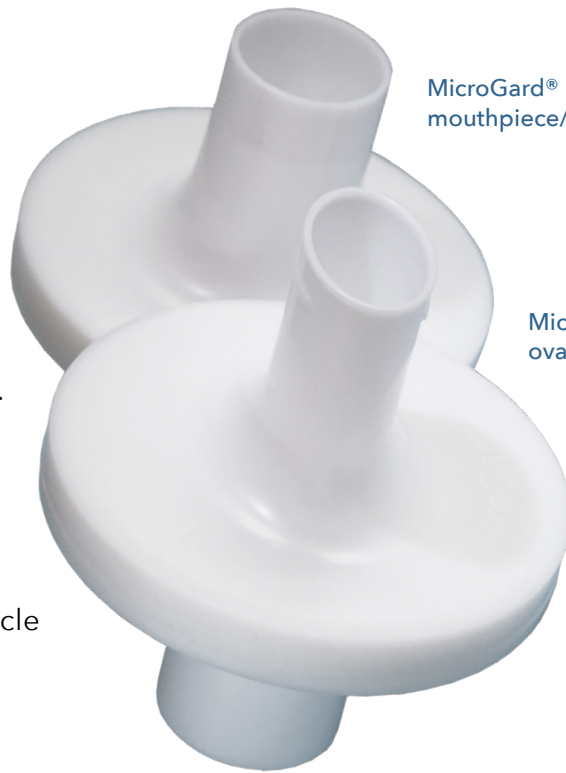
MicroGard® IIC round mouthpiece/connector