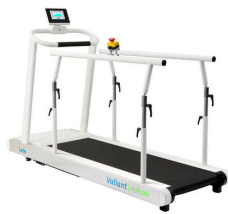
Valiant 2 rehab Valiant 2 rehab XL