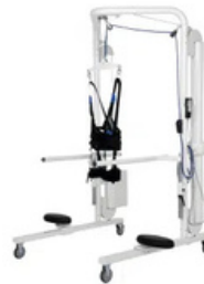
Body weight support system