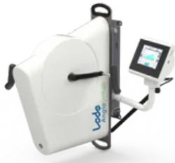
Angio static wall fixation