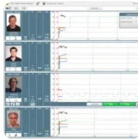
Lode Rehab Manager