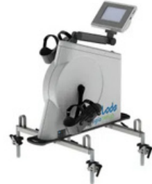
Angio fixation set