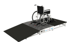
Esseda wheelchair ergometer